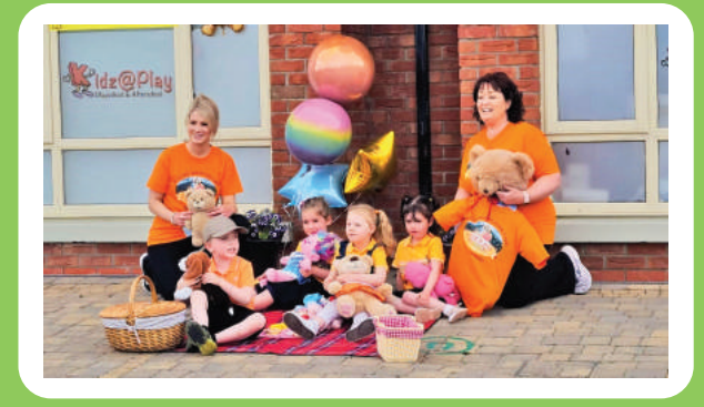
Thanks to all at Kidz@Play in Maynooth & Kilcock for organising the most gorgeous Teddy Bears' Picnic in support of our 20 children in Co. Kildare.